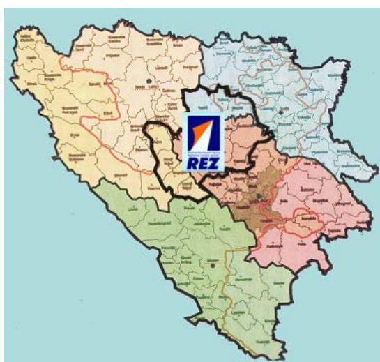
Figure 1. The economic regions of BiH.